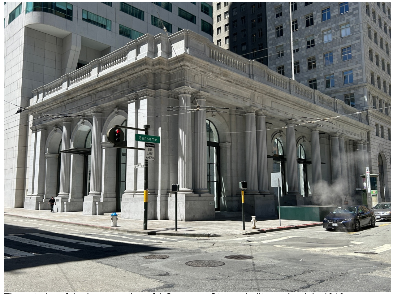
The exterior of the lower portion of 1 Sansome St. was built as a bank in 1910.